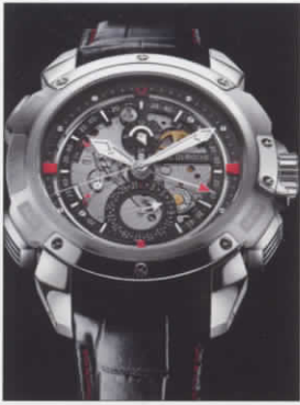
PIERRE DE ROCHE