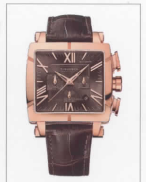
TIFFANY & CO